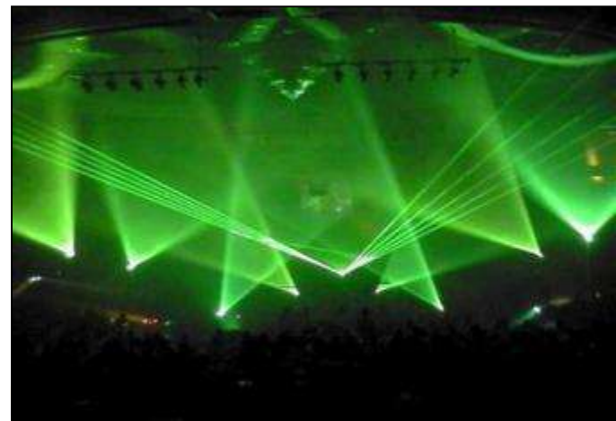
LIGHTING & SPECIAL EFFECTS